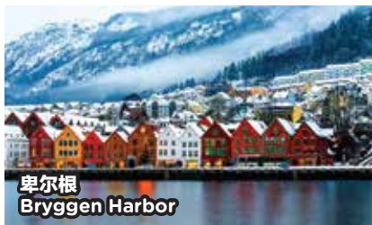
卑尔根 Bryggen Harbor