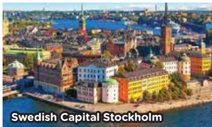
Swedish Capital Stockholm